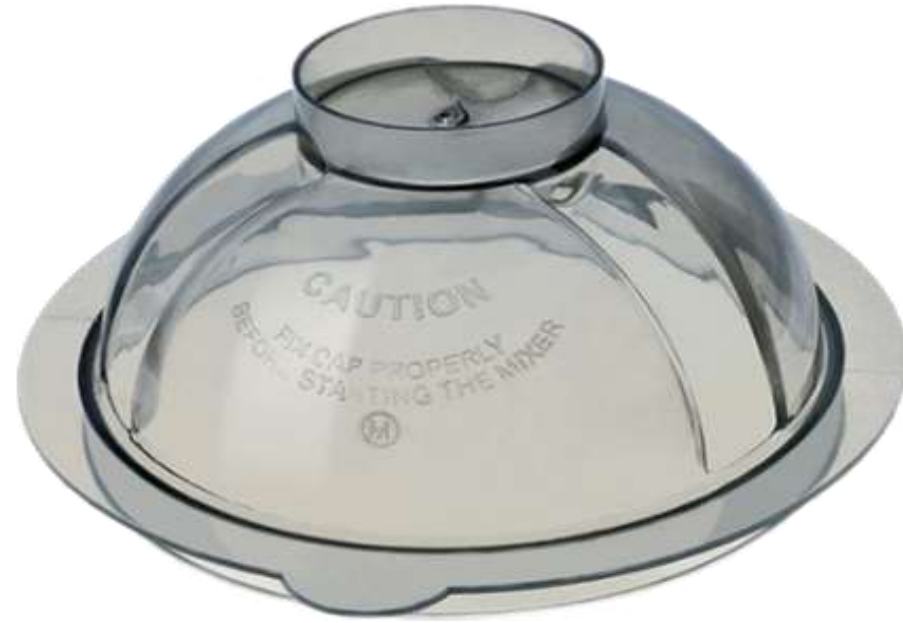
1-Rib Dome Smoke (M)