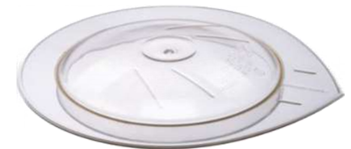
42-Leaf Multi Clear (M)