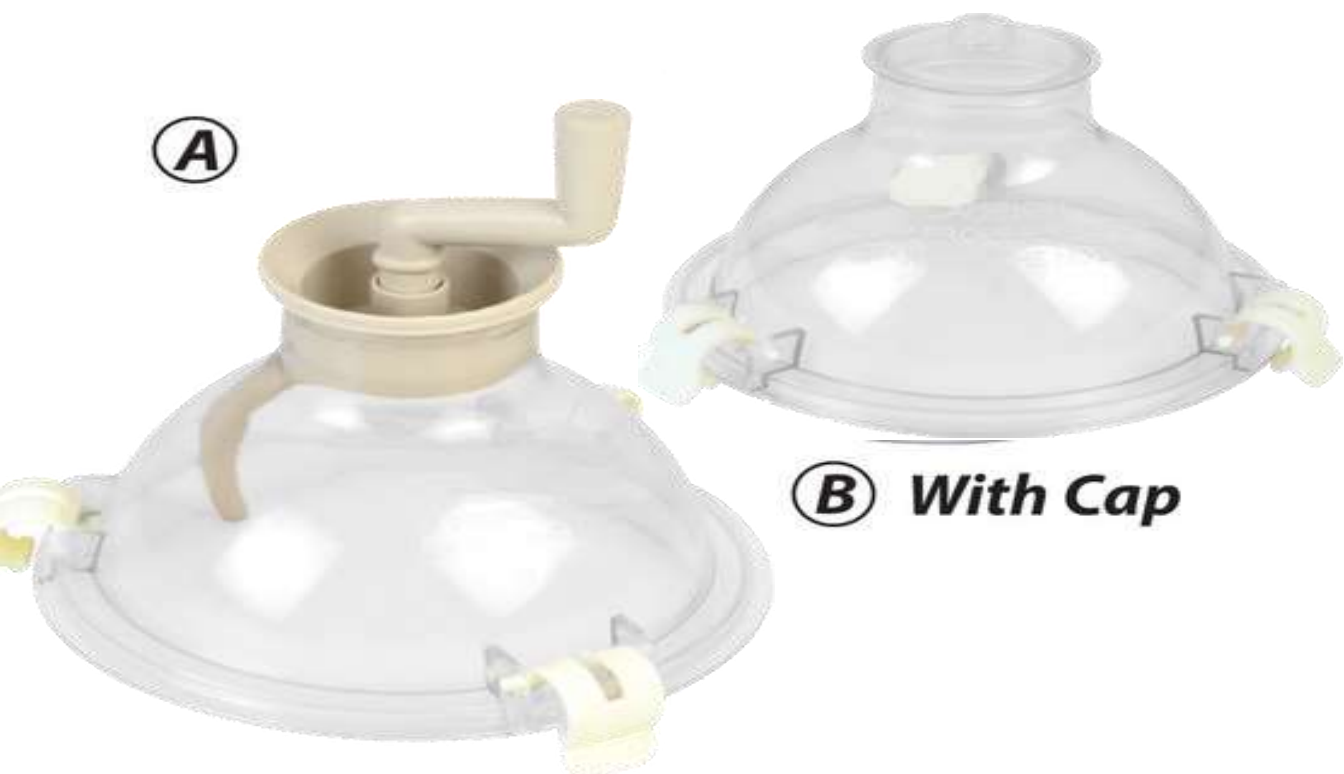
22-Kenstar Dome with Cap (M)