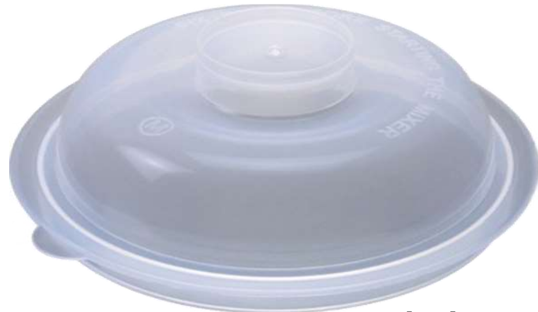
25-Appy Dome PP (M)