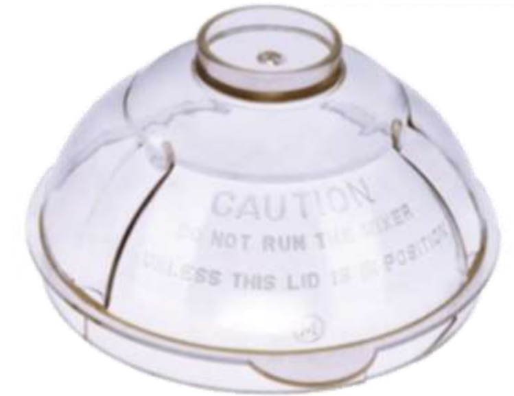
15-Crompton Multi Clear (M)