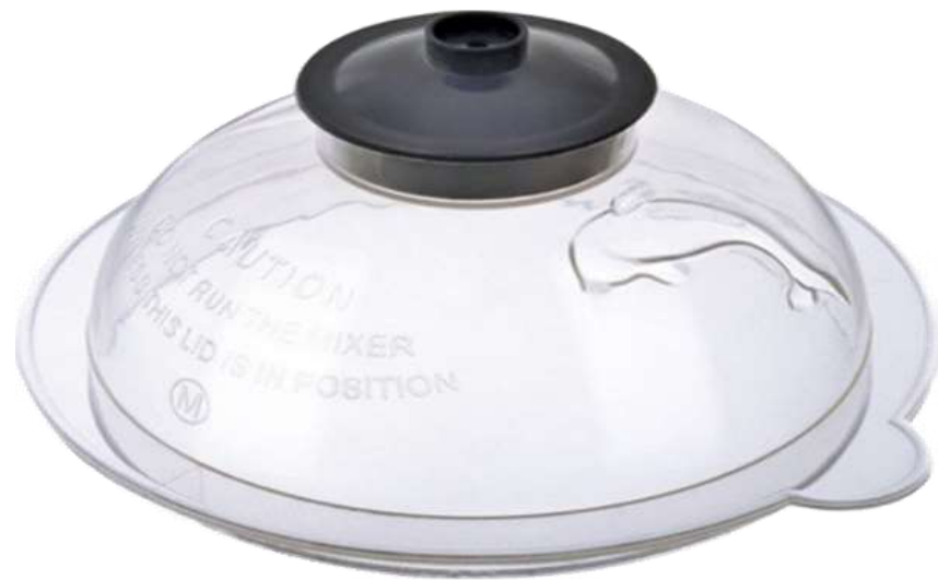
37-Dolphin Dome Clear (M)