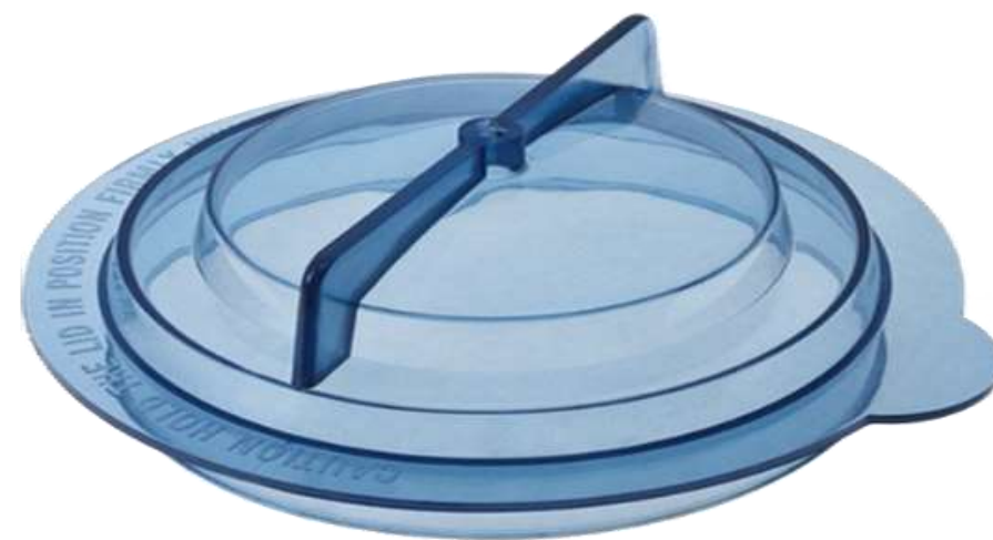
50-Deluxe Saara Cover Blue (M)