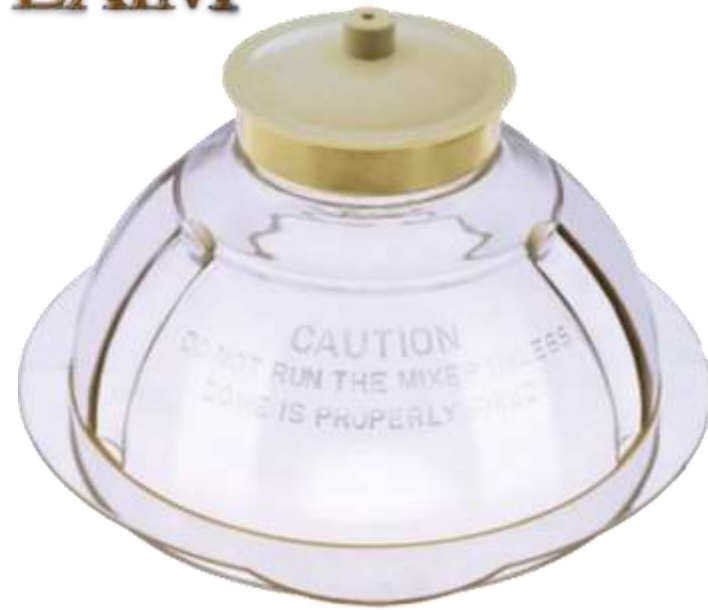
13-Crompton Dome Clear (M)