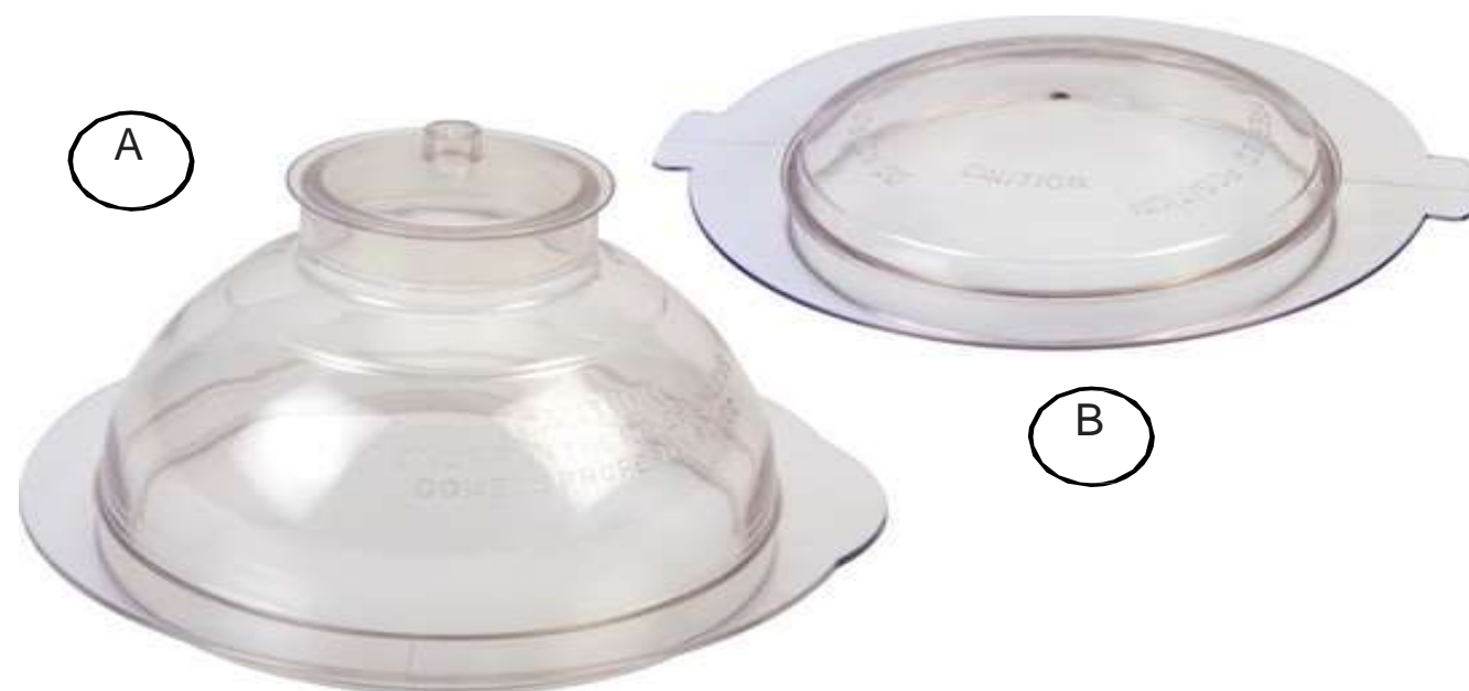
66-Super Heavy Dome/ Flat