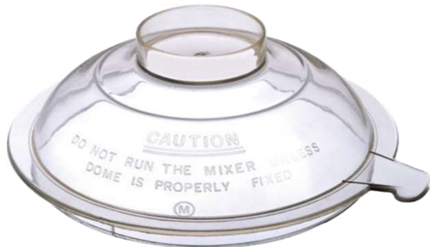
43-Maggi Dome Clear (M)