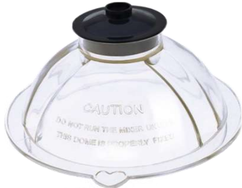
4-Rib Dome Clear (M)