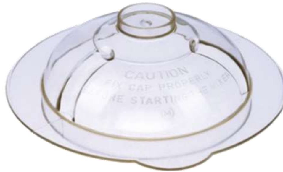
14-Crompton Flat Clear (M) Crompton Dome Set