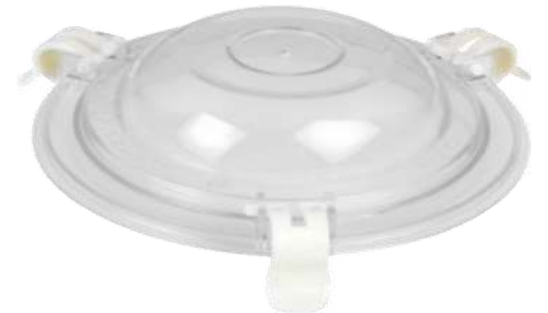
24-Kenstar Multi Clear (M)