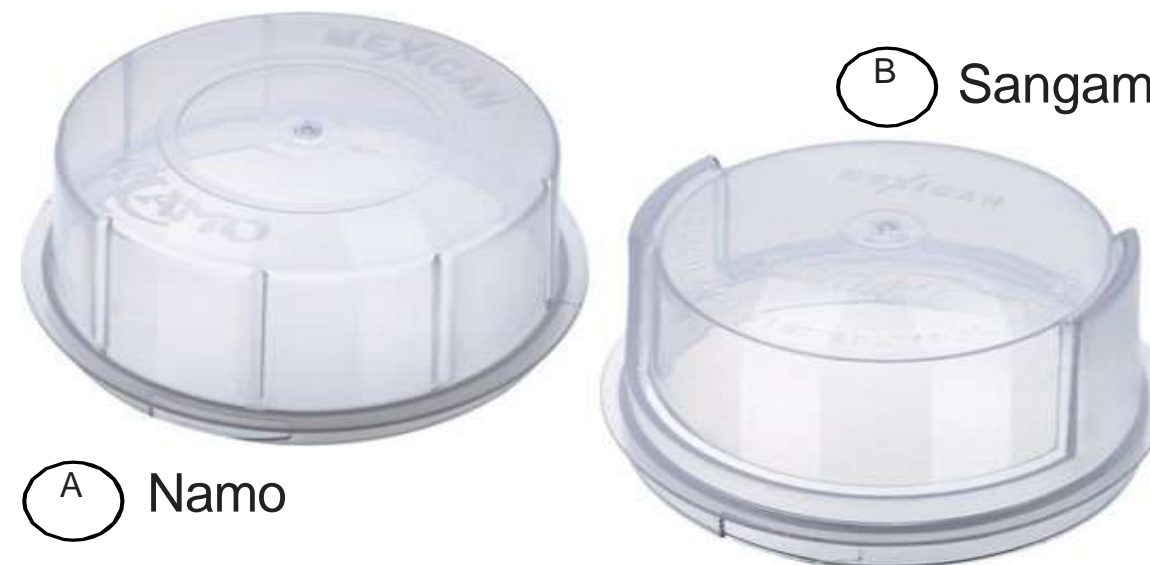
59- Multi Cover P.P