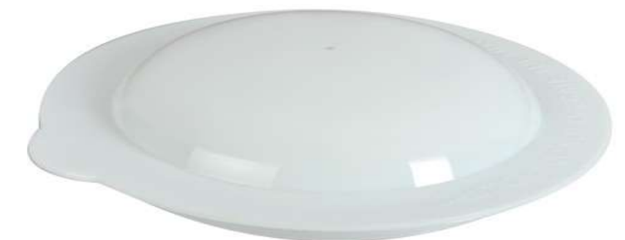
74- PP Chatni