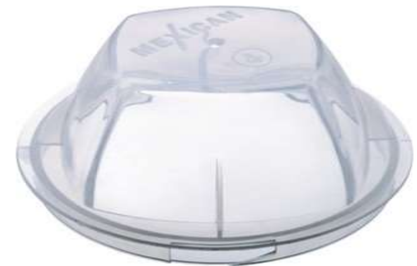
60- IV P.P