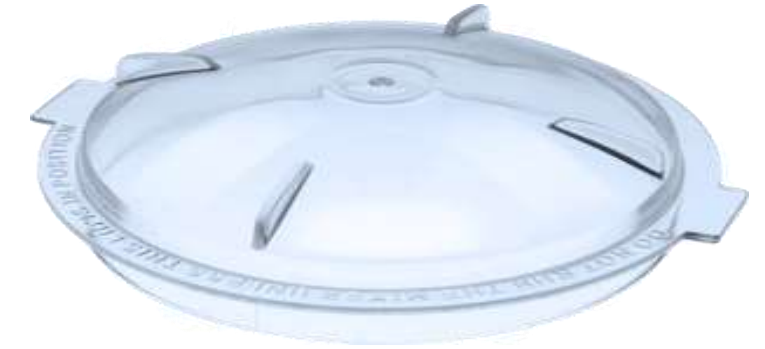
21- Pigeon Multi Clear (M)