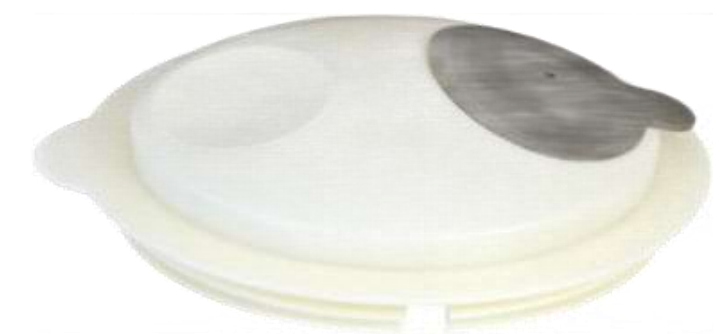
18-Marvel Multi Cover (M)