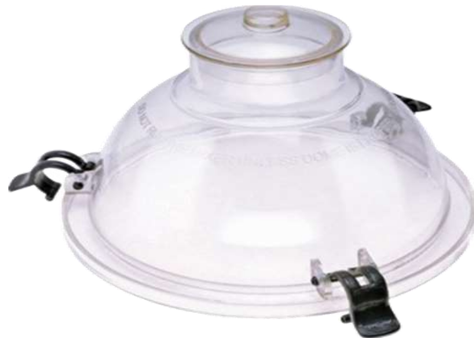
28-Sumeet Dome New Clear (M)