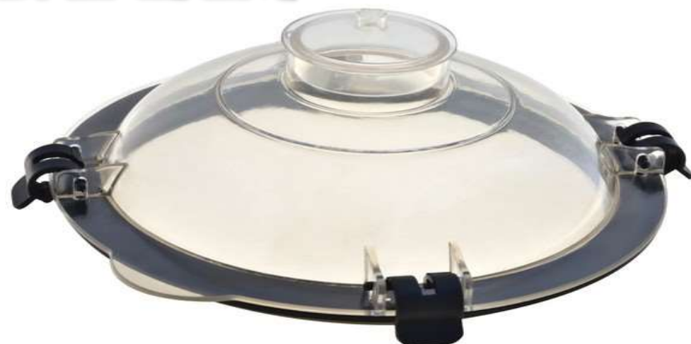
61-Big Hotel Dome with Ring