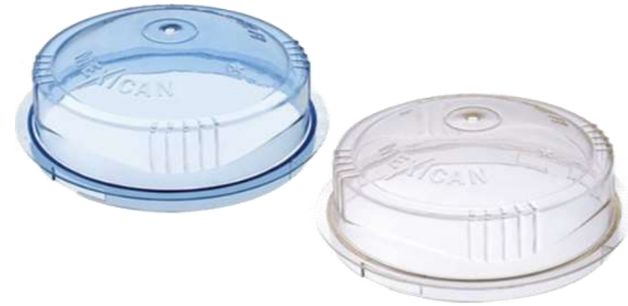
55-Silver Multi Cover Blue/Clear