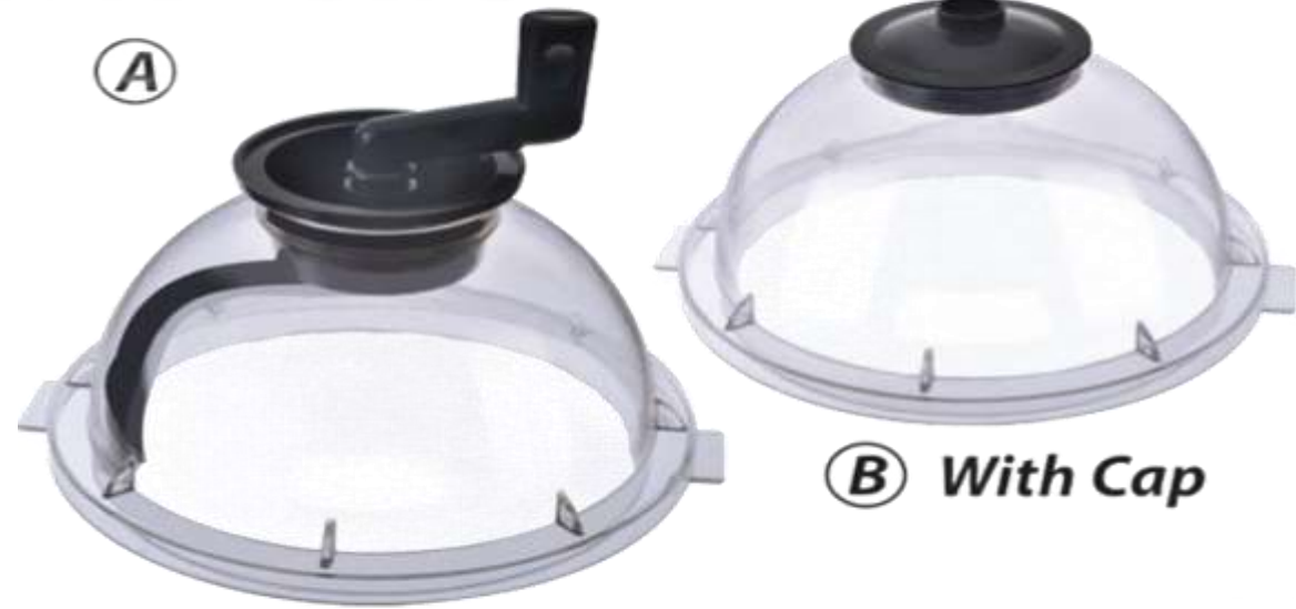
19-Pigeon Dome Clear with Scraper (M)