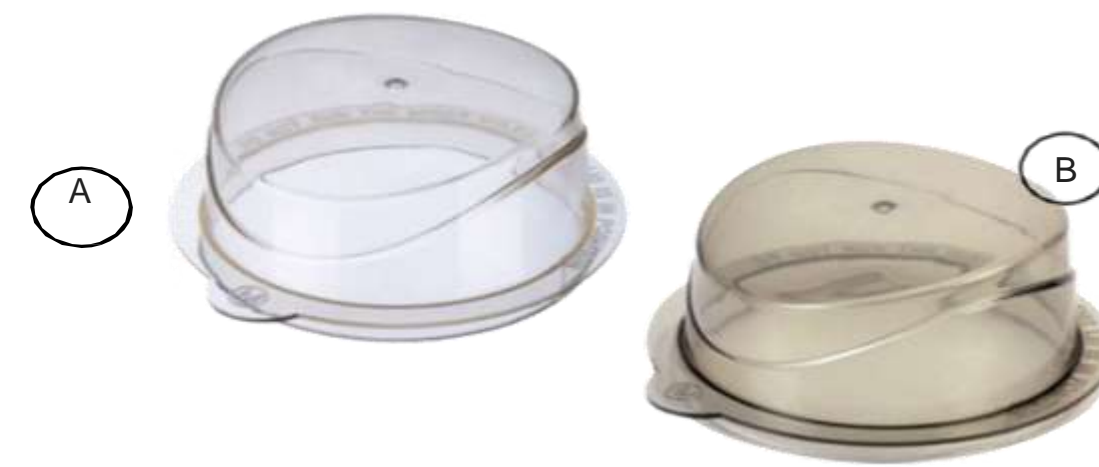
48-Ring Multi Cover Clear/ Smoke