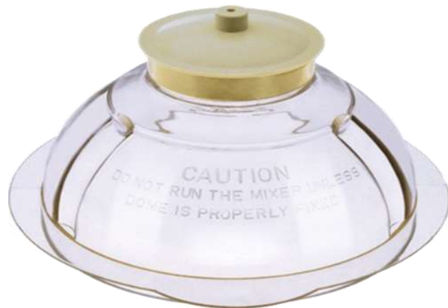
16- Marvel Dome Clear (M)