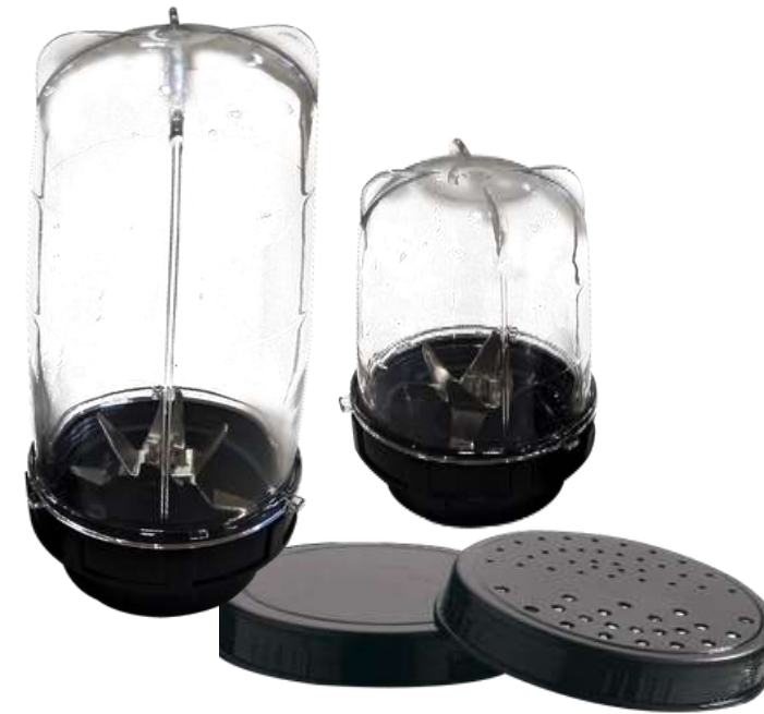
Bullet Jar with Caps