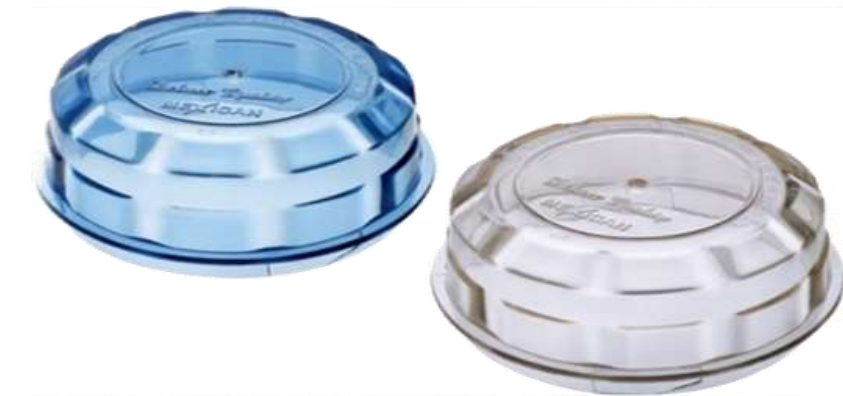
57- Multi Cover Blue/Clear