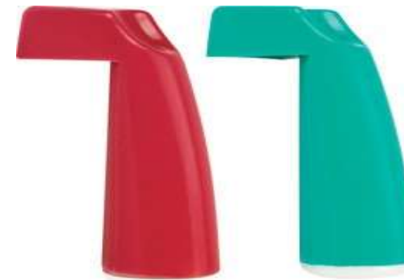
36 B-Deo Handle