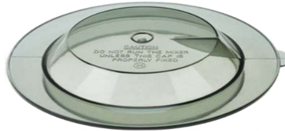
32-Sumeet Flat Green (M)