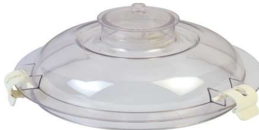
64-Medium Hotel Dome