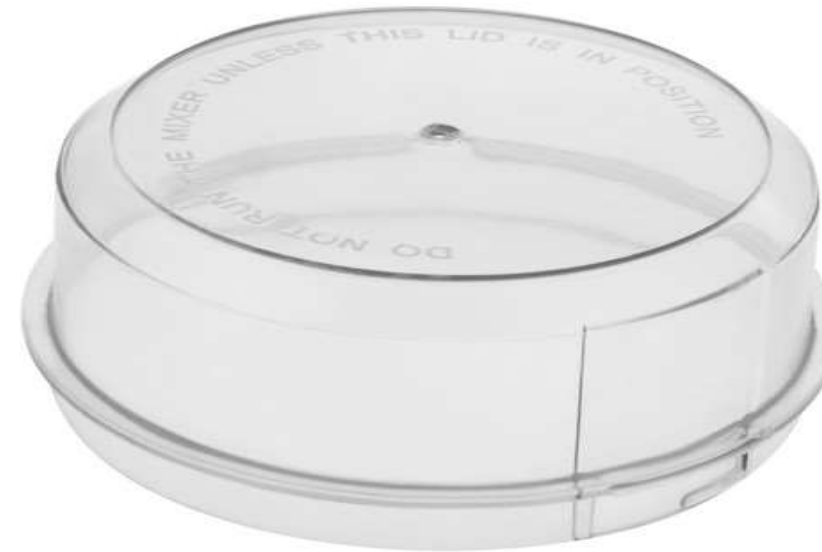
76- Royal Chatni Clear