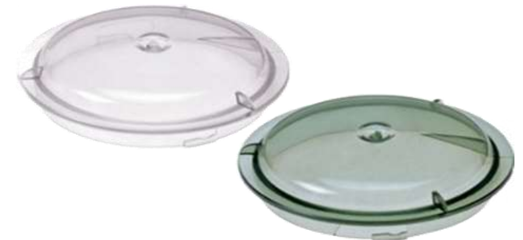
30-Domestic Multi Clear / Sumeet Colour