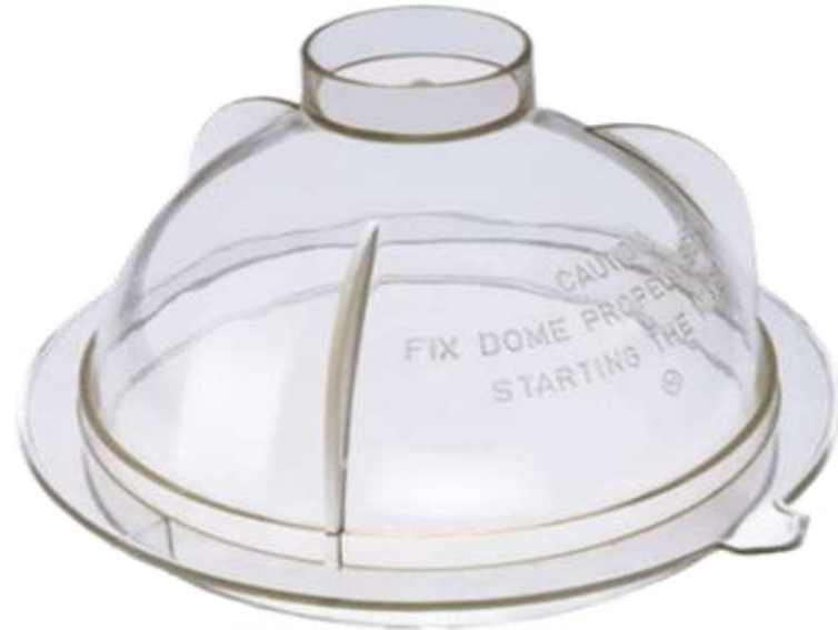
7-Butterfly Dome Clear (M)