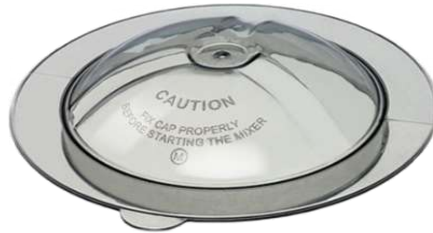
2-Rib Flat Smoke (M)