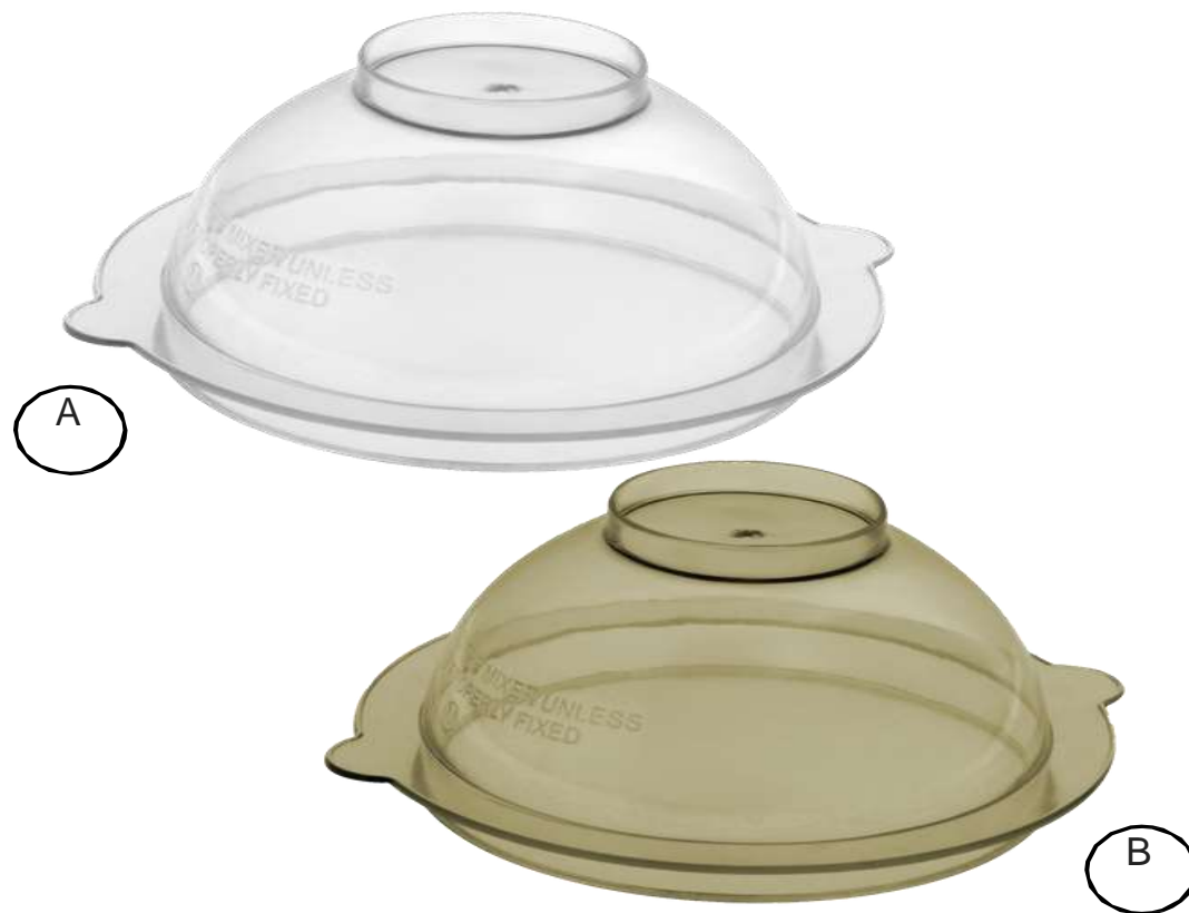
46-Medium Dome Clear/ Smoke (M)