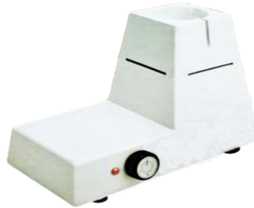
89-Sumeet Super Premium