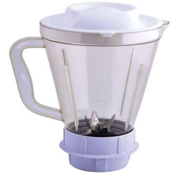
82- Juicer Jar