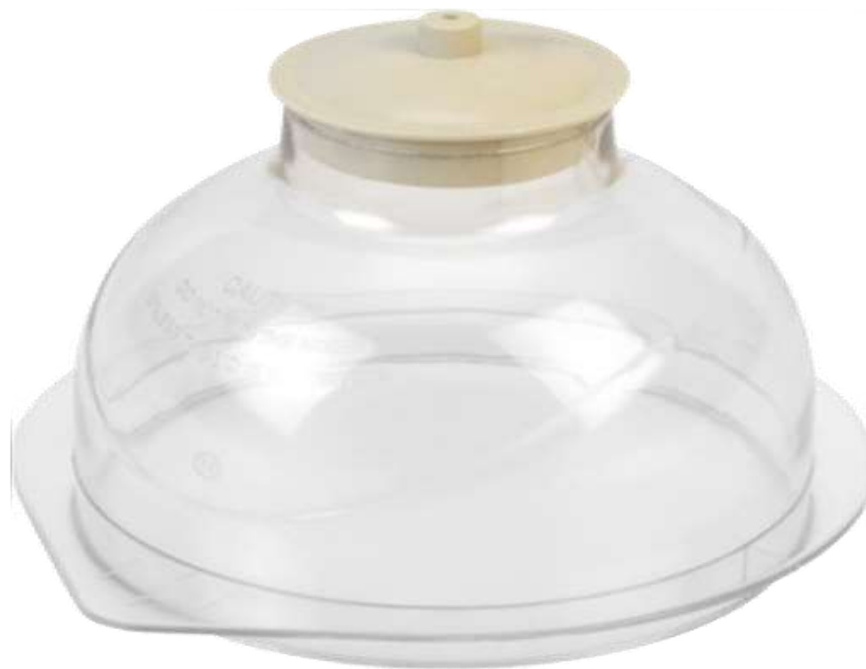
44-Big Leaf Dome (M)