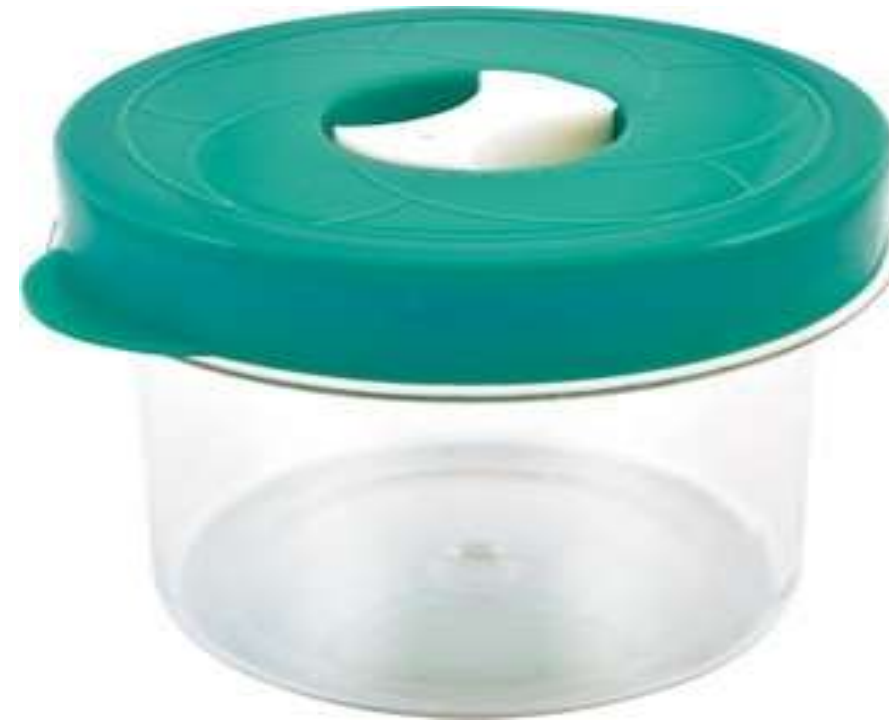
78- 2in1 Multi Cover & Container