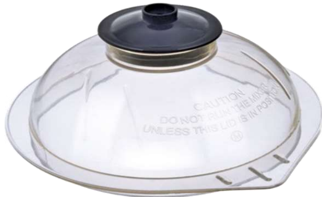
40-Leaf Dome Clear (M)