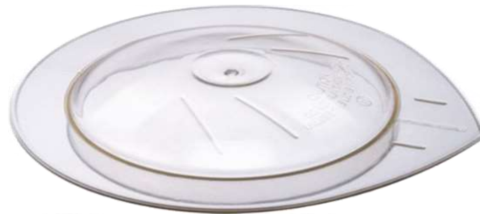
41-Leaf Flat Clear (M)