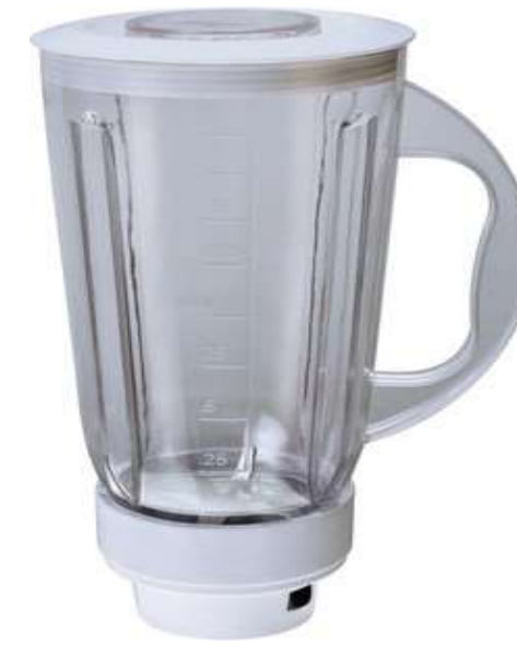
81-Commercial Jar- 2.25 Ltr.