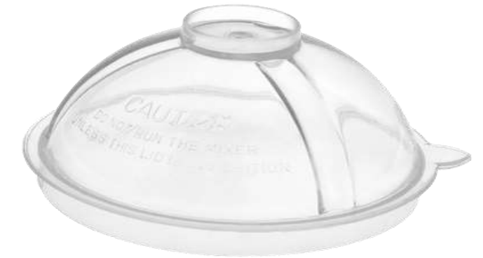
71- Lotus Chatni Clear