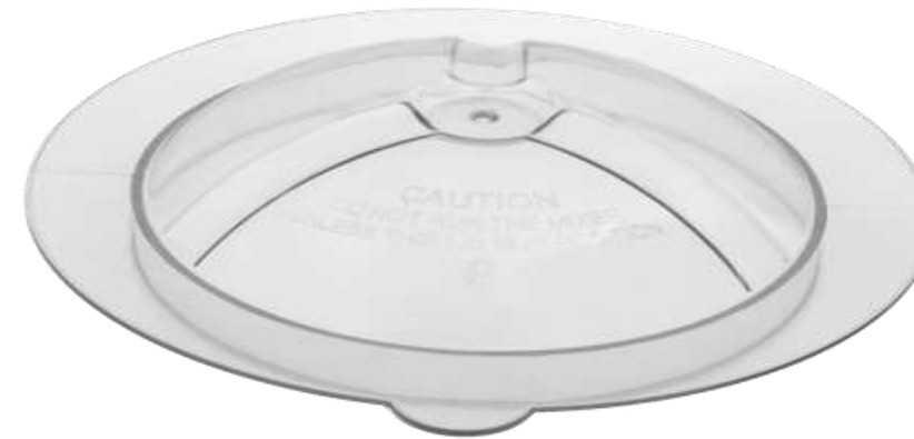
70- Lotus Flat Clear