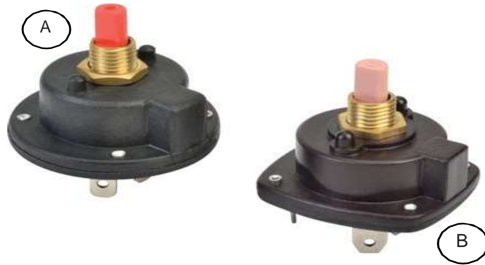
85-Rotary Switch- Round/Square