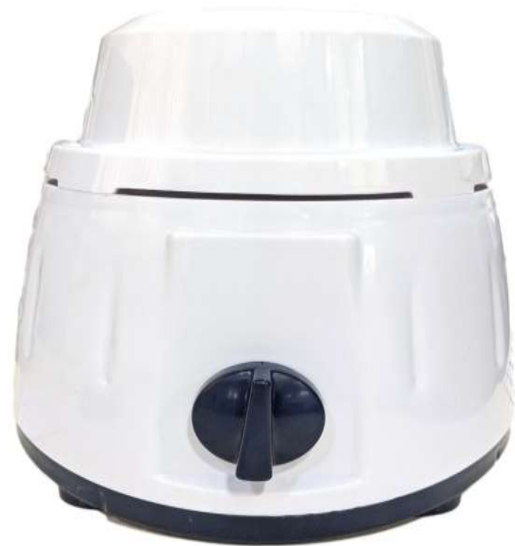
Big Hotel (1KG)