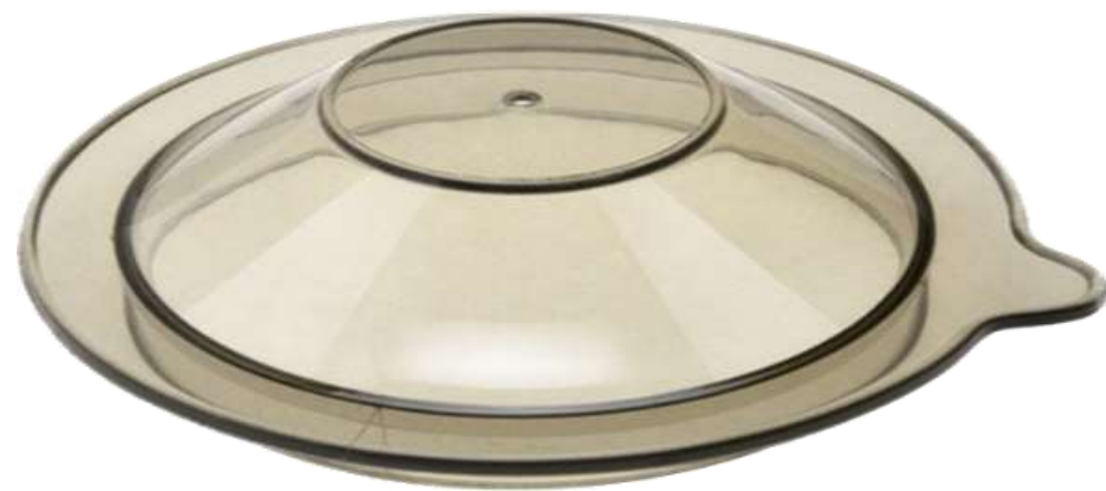
49-Saara Cover Smoke (M)