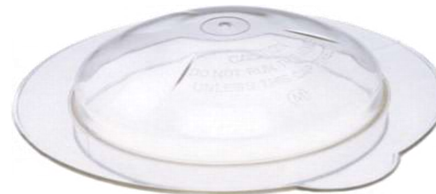
11-Jaipan Flat Clear (M) Jaipan Dome Set