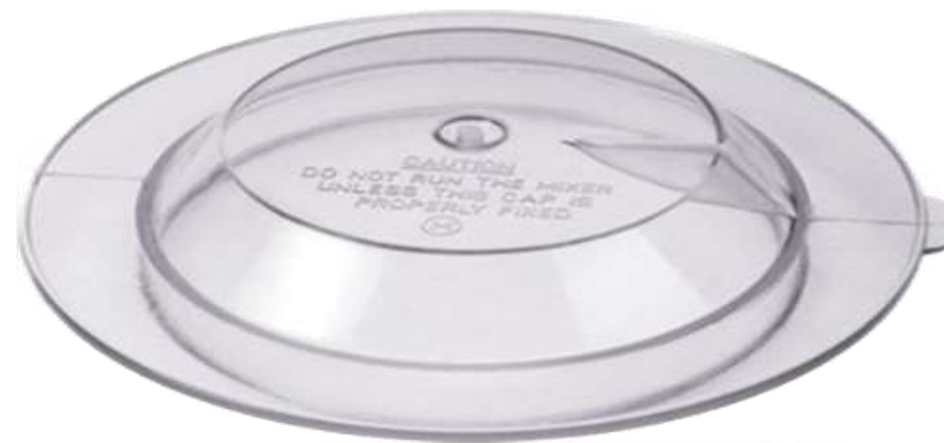
29-Sumeet Flat Clear (M)