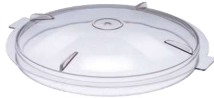
20-Pigeon Flat Clear (M) Pigeon Dome Set