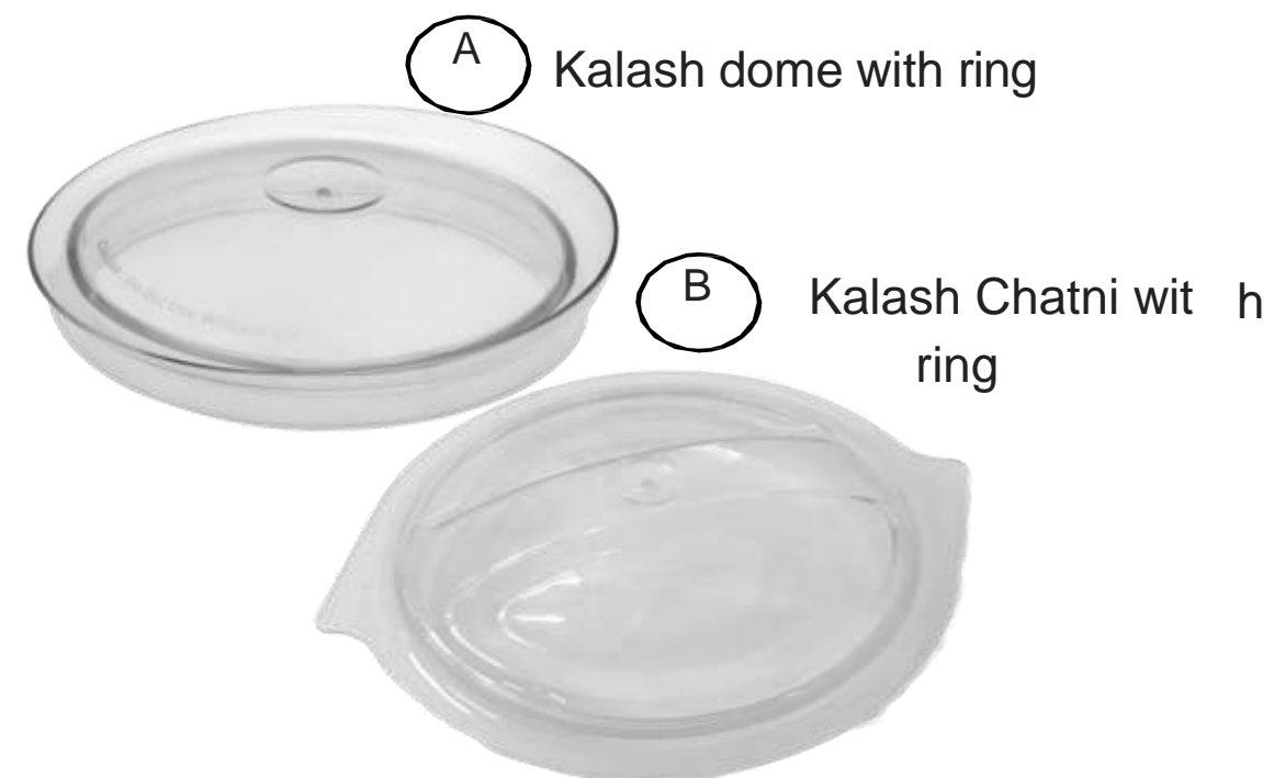
67- Kalash Dome Set (3 Pcs)