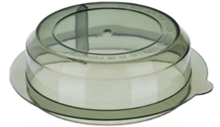
33-Sumeet Ring Multi (M)