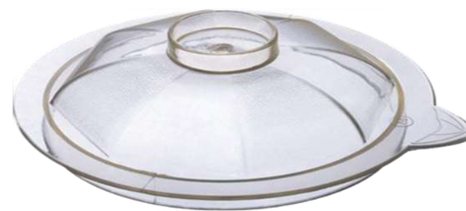
51-JMG Juicer Cover (M)