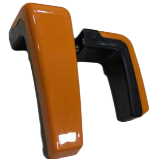
36 C-Kalash Handle Big/Small