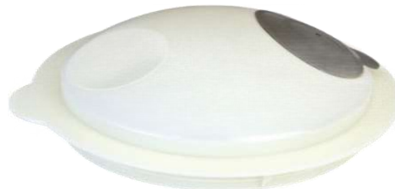
17-Marvel Flat Cover (M) Marvel Dome Set