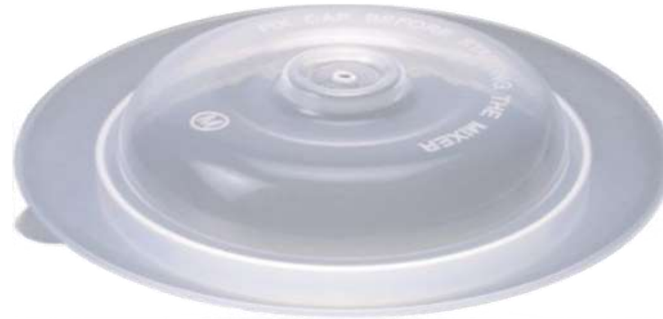
26-Appy Flat PP (M)