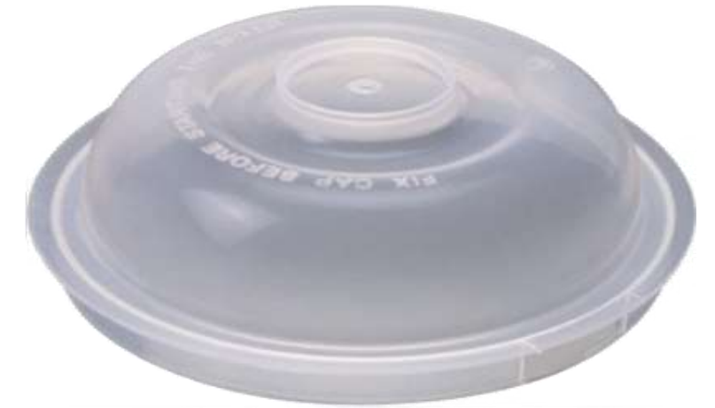
27- Appy Multi PP (M)