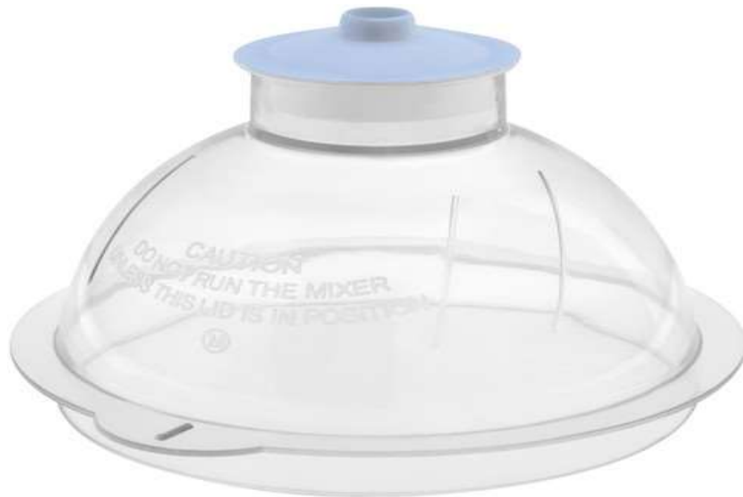
72- PP Dome Clear