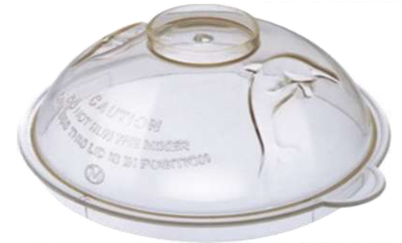
39-Dolphin Multi Clear (M)