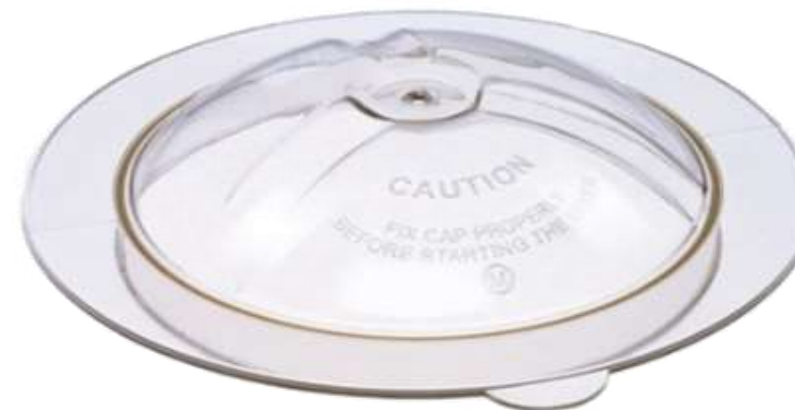
5-Rib Flat Clear (M)