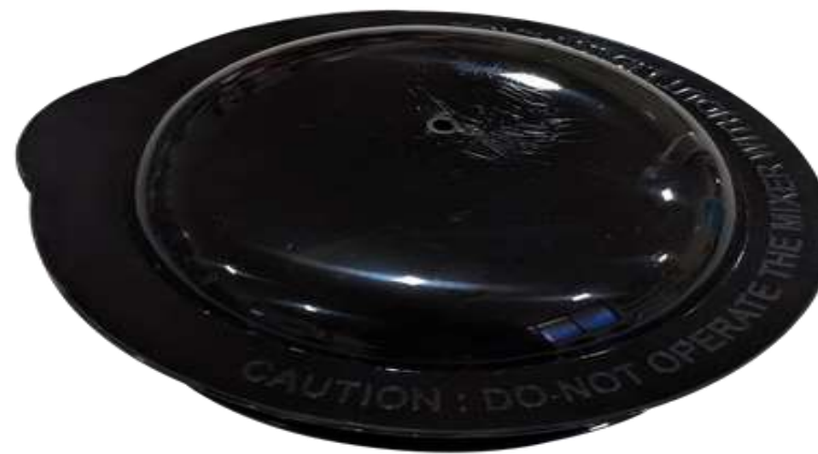
Havells Flat Havells Dome Set