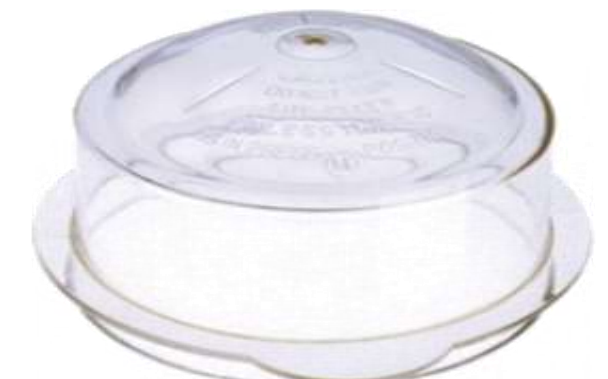
12-Jaipan Multi Clear (M)