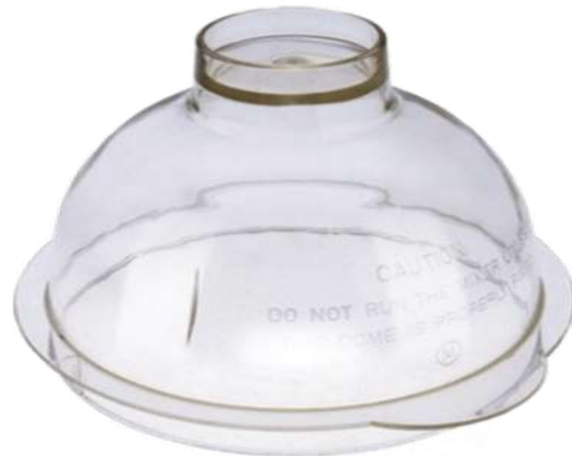
10-Jaipan Dome Clear (M)