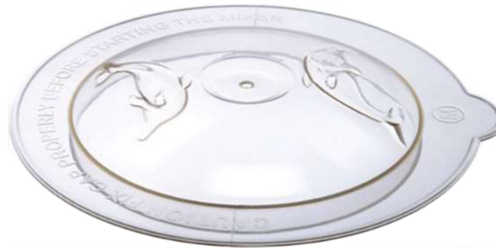
38-Dolphin Flat Clear (M)