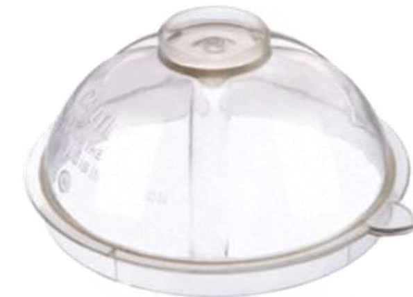
6-Rib Multi Clear (M)