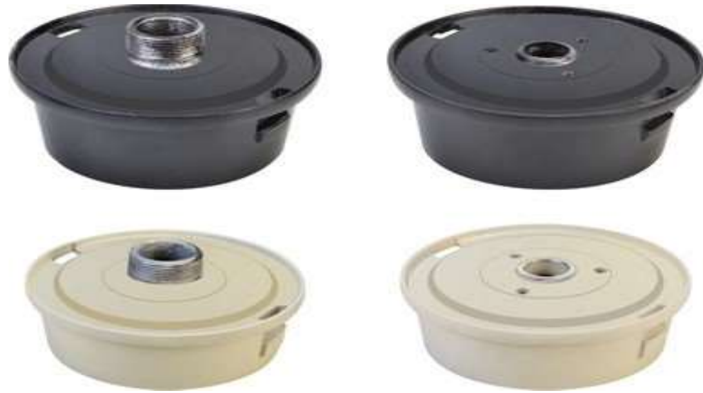
83-Aluminium Socket - 70/80/100gm