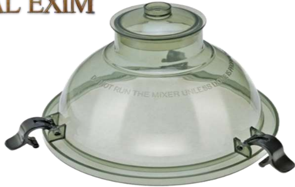
31-Sumeet Dome New Green (M)