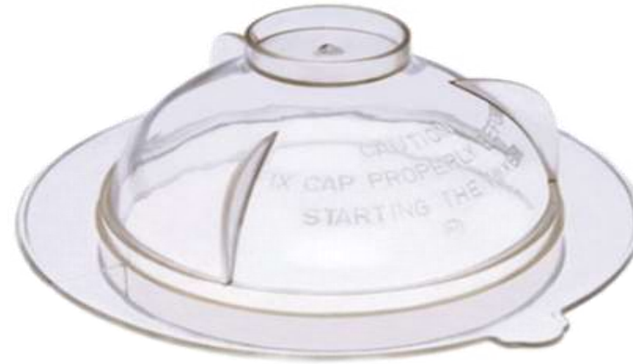
8-Butterfly Flat Clear (M) Butterfly Dome Set (Clear)