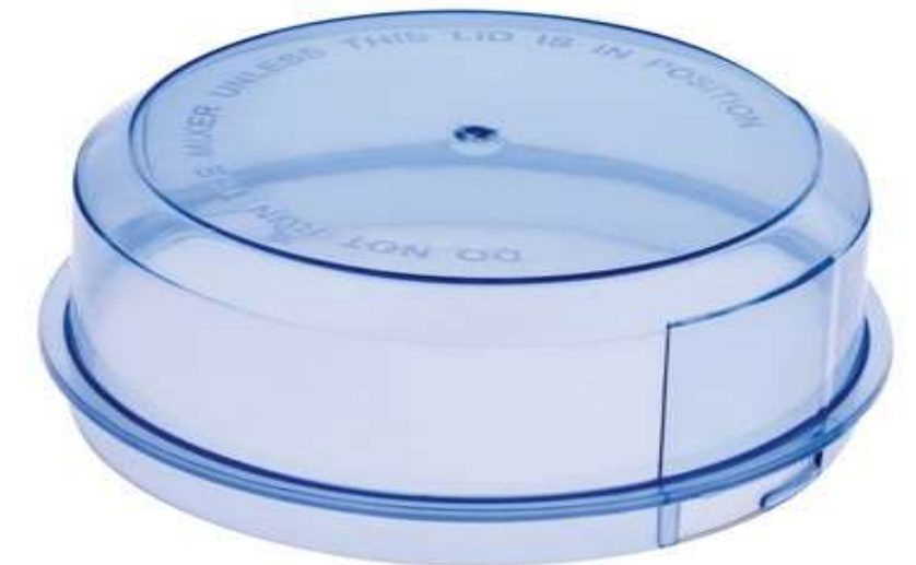
77- Royal Chatni Blue