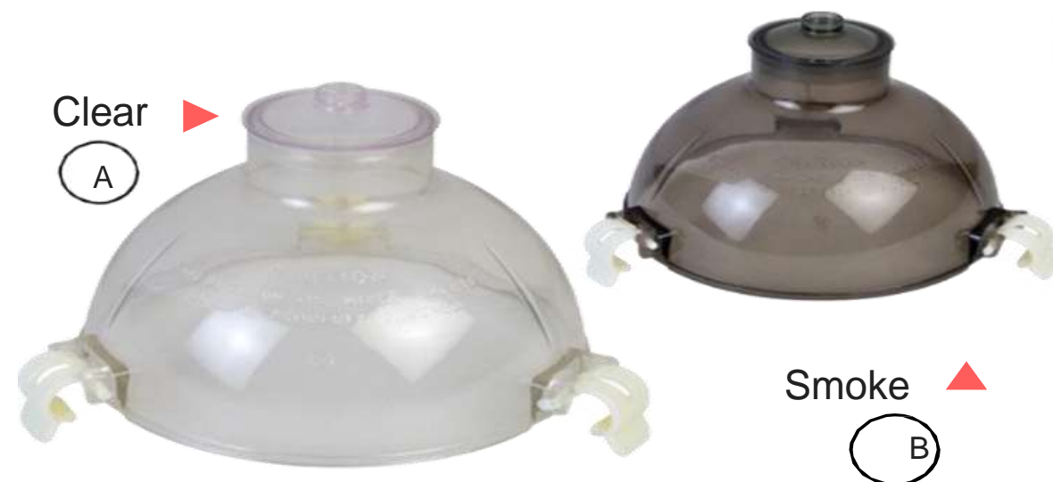
52-Sumeet Dome Clear Plastic Clip (M)