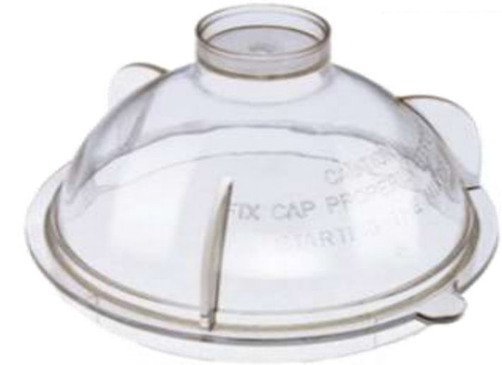
9-Butterfly Multi Clear (M)