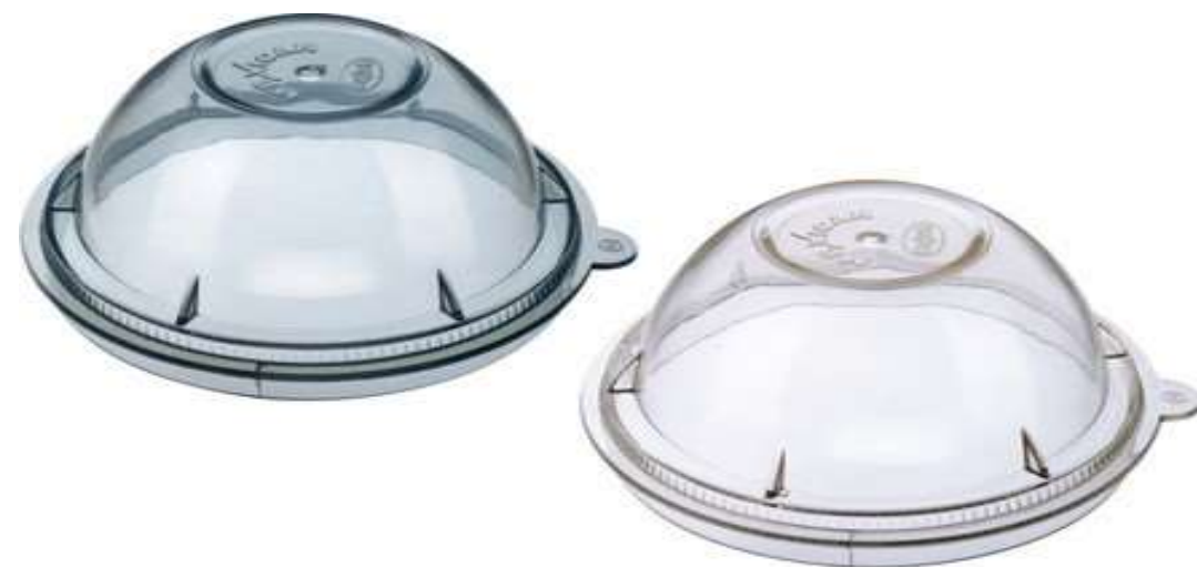
58-Rajat Multi Cover Blue/Clear