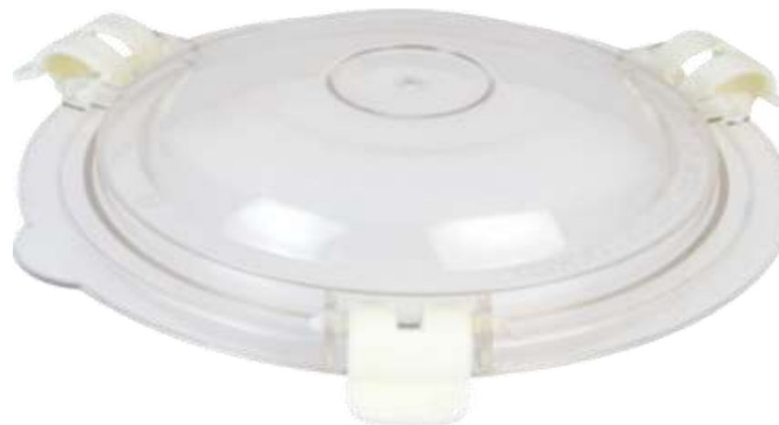
23-Kenstar Flat Clear (M) Kenstar Dome Set