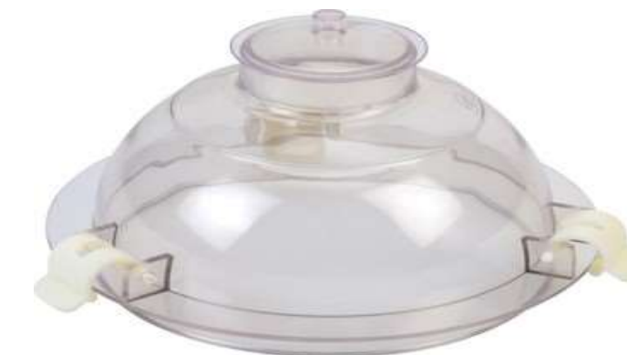
65-Small Hotel Dome