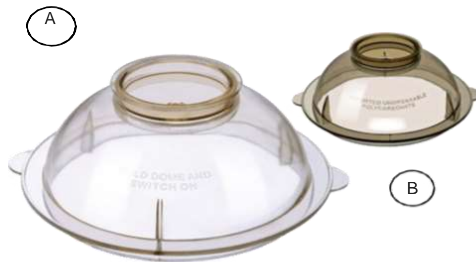
47-Medium Dome with Cap Clear/ Smoke