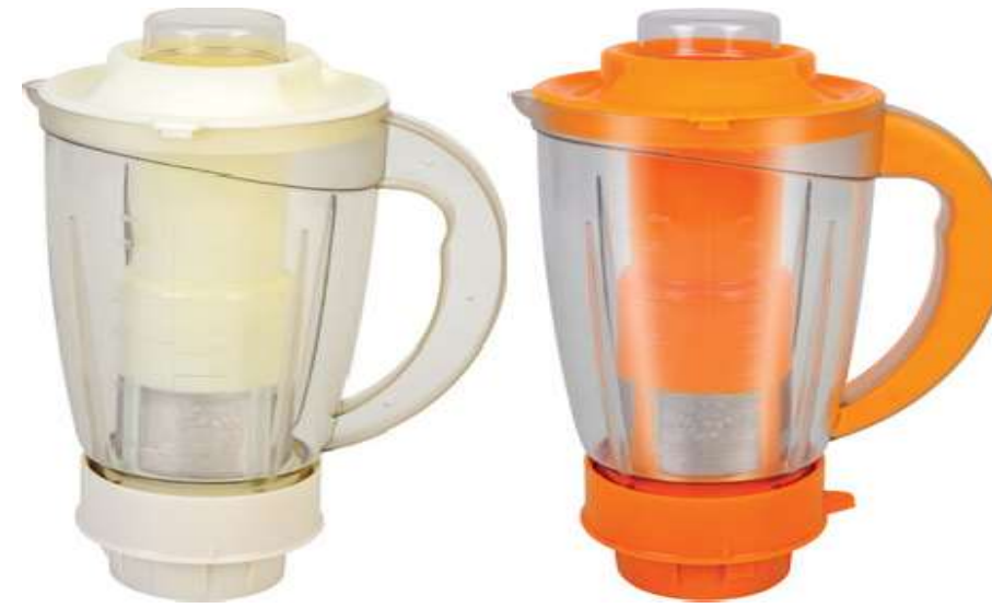
80- Blender Jar