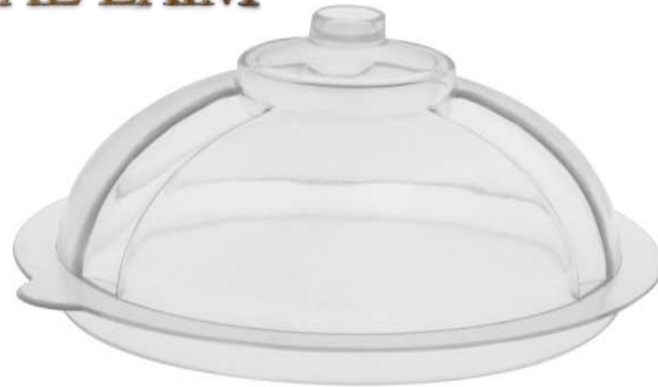
69- Lotus Dome Clear